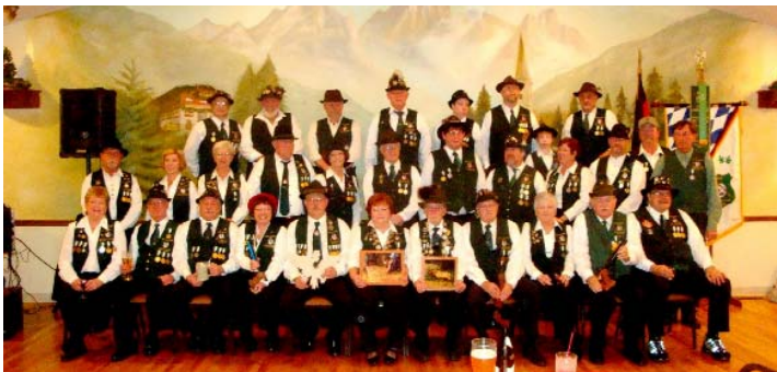
SVP Shooters at Their Appreciation Banquet

March 9: Roast Pork, Wienerwald Huehnchen (Baked chicken), or Fried Tilapia