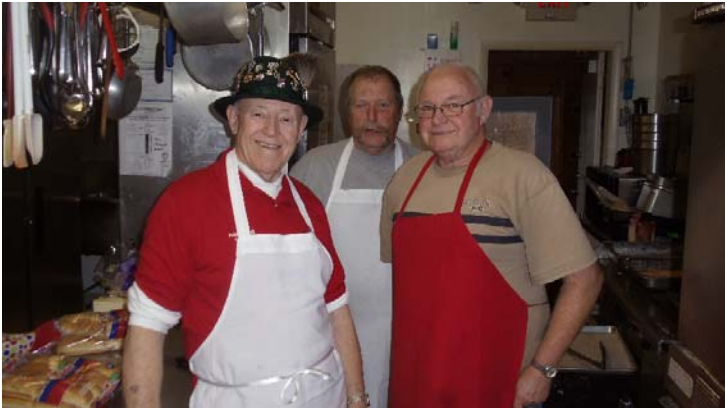
Members of the Kriskindlmarkt Kitchen Crew