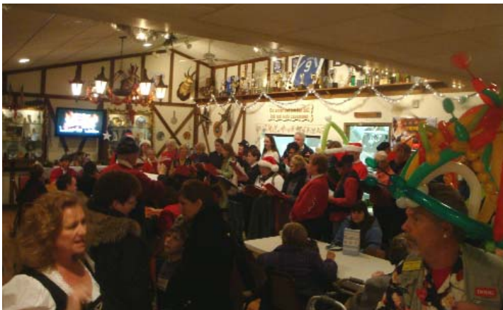
Carolers at Last Year's Kristkindlmarkt

Dec. 30: Ziguener Schnitzel (Gypsy Schnitzel) or Beef Stroganoff