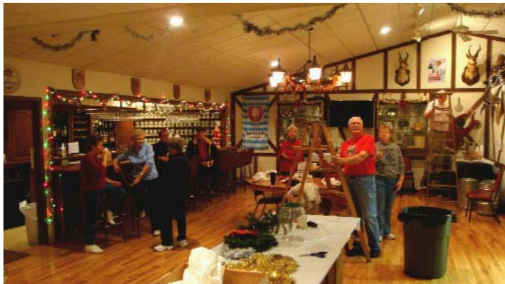
Decorating the Hall for the Kristkindlmarkt

Anyone who joins any of the affiliates between now and year end gets the remaining months of 2011 included in their dues for 2012 at no extra cost.