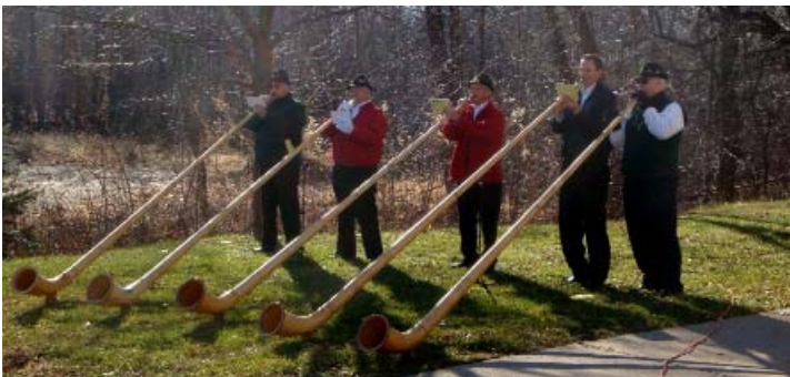
The Lindenhof Echos at Our Kristkindlmarkt