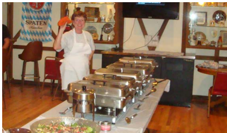
Setting Up a Buffet at the Lindenhof

Anyone who joins any of the affiliates between now and year end gets the remaining months of 2011 included in their dues for 2012 at no extra cost.